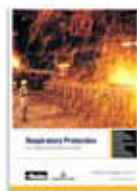
Respiratory Protection For Hazardous Environments 174004822