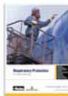
Respiratory Protection For Tank Cleaning 174004821