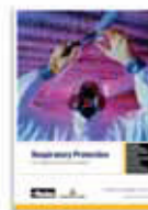
Respiratory Protection For Asbestos Environments 174004823