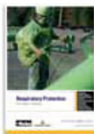
Respiratory Protection For Spray Painting 174004820

If you would like more information about Parker domnick hunter products please visit: www.domnickhunter.com , Email: dhindsales@parker.com or contact your local Parker domnick hunter representative.