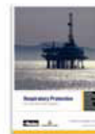
Respiratory Protection For Oil & Gas Industry 174004824